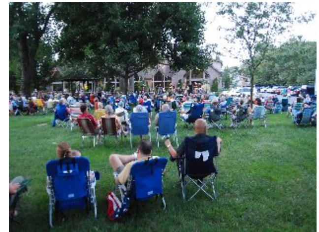
Directions to Stango Park

In case of rain concerts may be held at St Peters Church in Lewes. Check bulletin boards at WSFS Bank and next to the Lewes Public Library